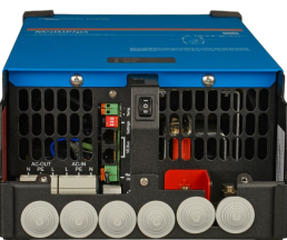
MultiPlus 2000 VA (bottom cover removed)