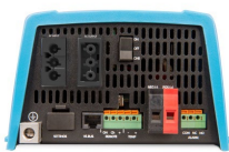
MultiPlus 500 / 800 / 1200 / 1600 VA